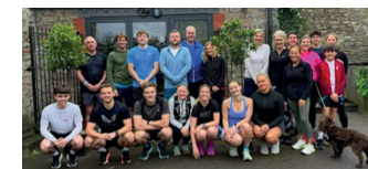
Last year's Good Friday runners