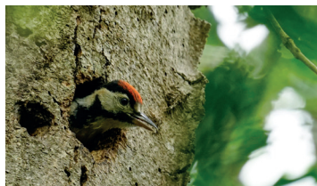
Great spotted woodpecker in its nest on the Downs

Leigh Woods not only offers many plants and animals a valuable habitat, but also the opportunity for those species and their genes to move between other sites. Ashton Court, is another Site of Special Scientific Interest (SSSI) which is very close to Leigh Woods so that birds, bats, insects, pollen and seeds can move between the sites. Parts of Leigh Woods are also part of the Avon Gorge SSSI and Special Area of Conservation (SAC) connecting to the cliffs and Downs on the Bristol-side. Further into North