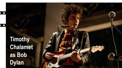
Timothy Chalamet as Bob Dylan